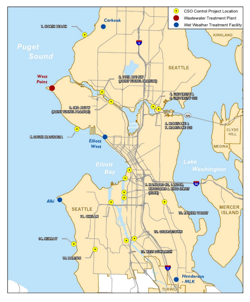
FIGURE 1: CURRENT AND FUTURE PROJECTS OF THE CSO SYSTEM

Projected CSO expenditures have been included in Table 12—"Capital Improvement Plan— Projected Expenditures" and total $669 million for the period 2018 through 2024. Expenditures for the two largest projects currently in design and construction are $189.0 million for Georgetown and $120.1 million for the Joint Project.