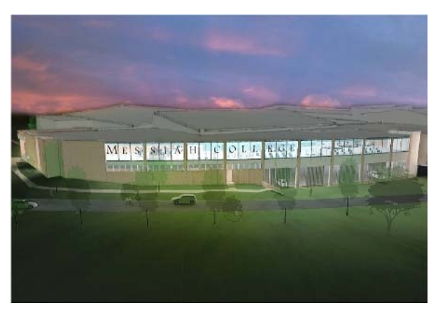
Sollenberger Sports Center Renovations

The proceeds of the 2016 Bonds will be used to construct new facilities and additions to existing buildings associated with the recreational, wellness and fitness activities of the College. In addition to sports management and other health and wellness related academic programs, non-student athletes and students participating in Messiah's 22 formal athletic teams will actively use the updated facilities. Messiah is an NCAA Division III institution, participating in the Middle Atlantic Conference. Messiah's athletic accomplishments include nearly 50 women's and more than 30 men's conference titles as well as the following national championships: