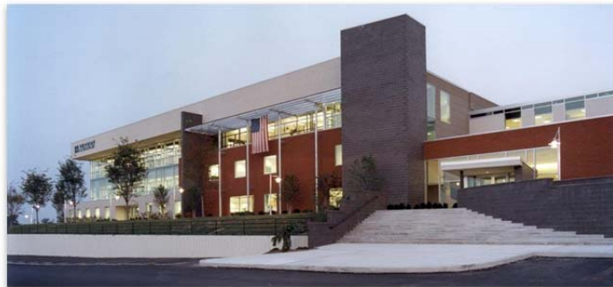
Location of Occupational and Physical Therapy Programs to begin in 2017

Approximately eight years ago, the College began to strategically contemplate the addition of key graduate programs which would complement Messiah's niches and build on its long standing academic strengths. Now six years strong, graduate programs have witnessed steady growth and are an important addition to the College's revenues. The following information summarizes the growth of Messiah graduate activities.