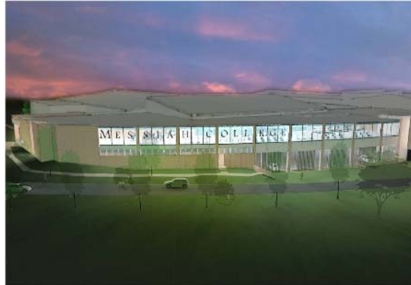
Sollenberger Sports Center Renovations

The proceeds of the 2016 Bonds will be used to construct new facilities and additions to existing buildings associated with the recreational, wellness and fitness activities of the College. In addition to sports management and other health and wellness related academic programs, non-student athletes and students participating in Messiah's 22 formal athletic teams will actively use the updated facilities. Messiah is an NCAA Division III institution, participating in the Middle Atlantic Conference. Messiah's athletic accomplishments include nearly 50 women's and more than 30 men's conference titles as well as the following national championships: