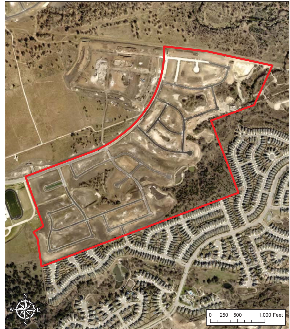
WC MUD 19E Location Map