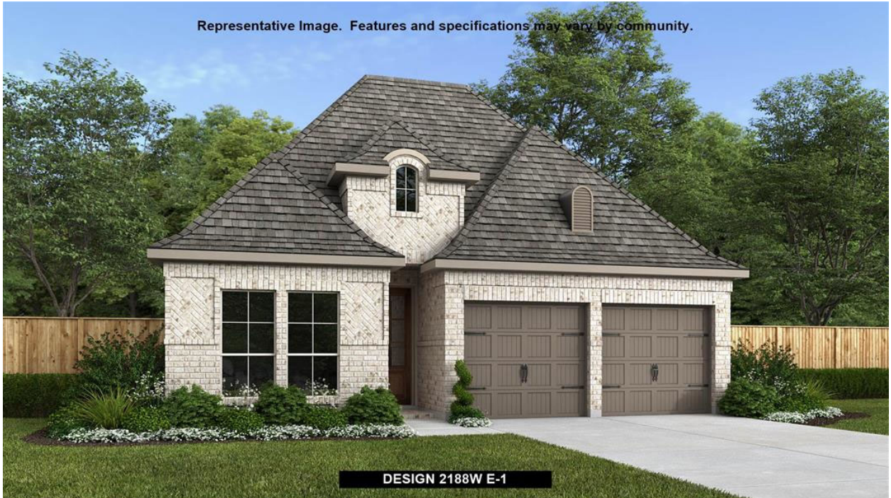
DESIGN 2188W E-1

Representative Image. Features and specifications may vary by community.