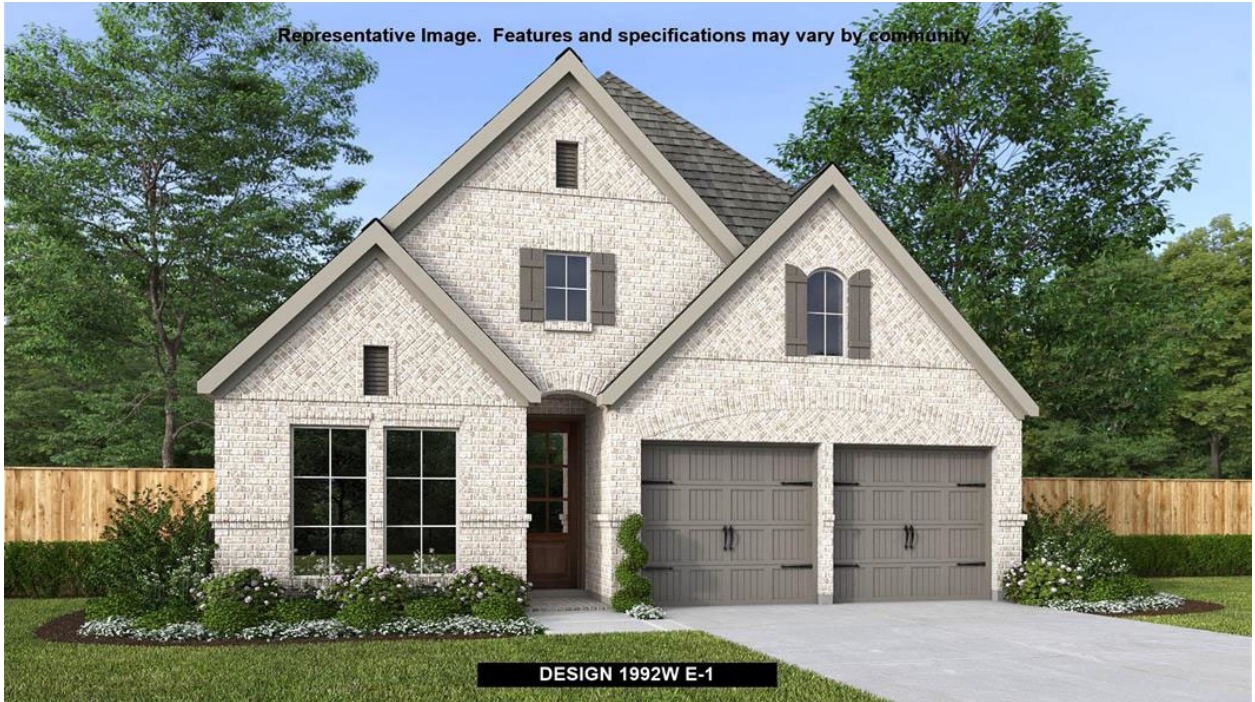
DESIGN 1992W E-1

Representative Image. Features and specifications may vary by community.