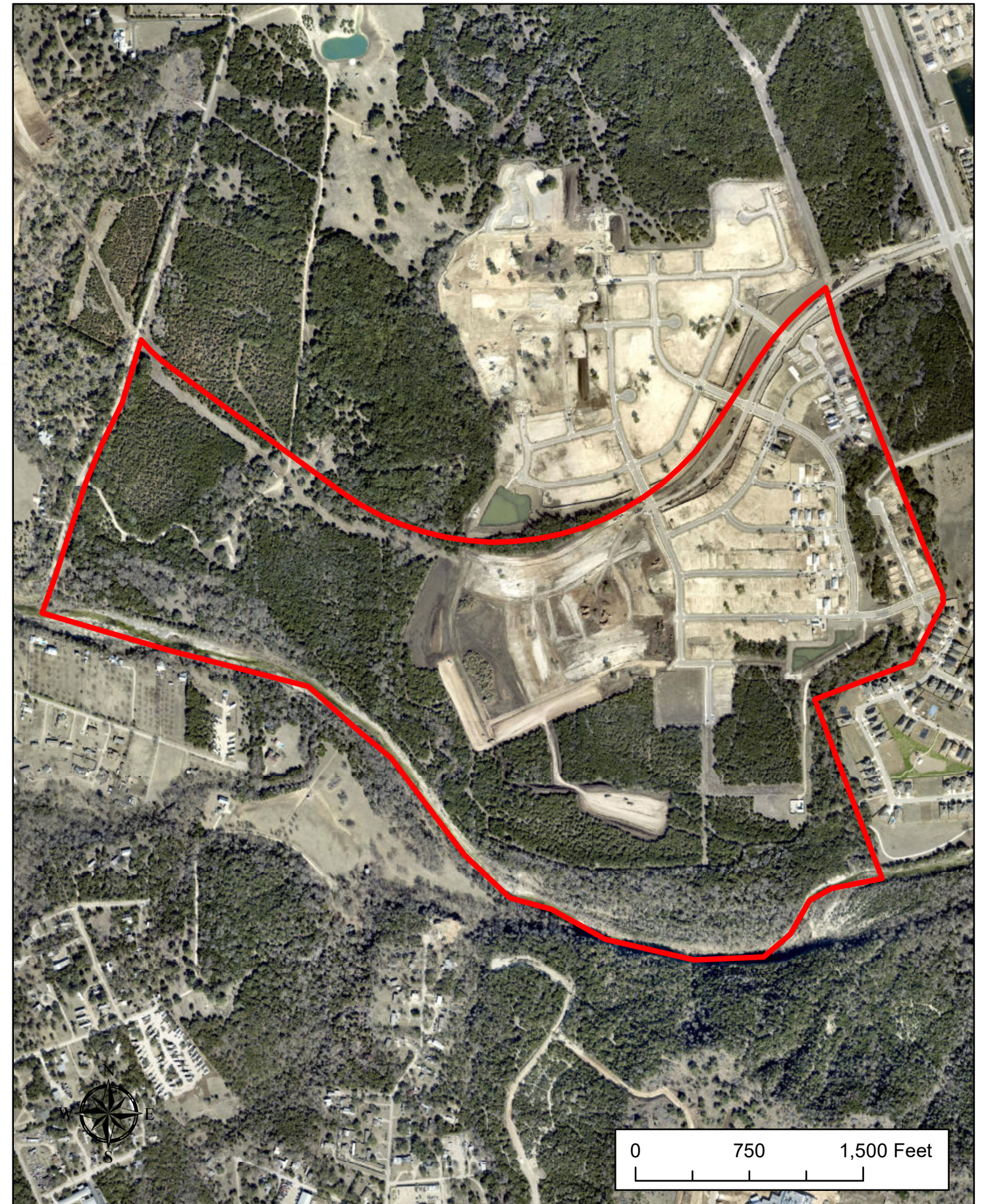
Leander MUD 1 Location Map