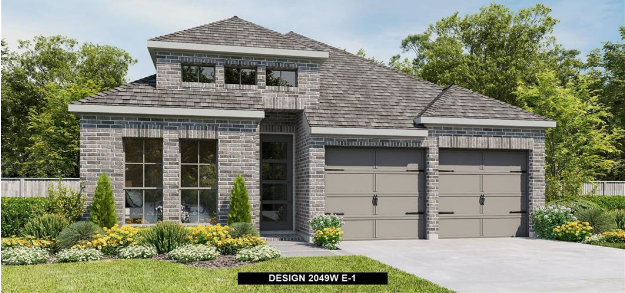
DESIGN 2049W E-1

Representative Image. Features and specifications may vary by community.