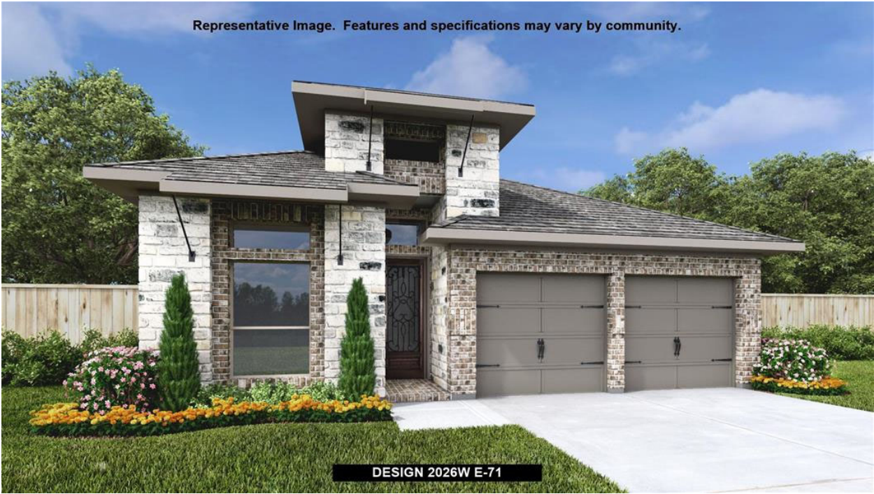
DESIGN 2026W E-71

Representative Image. Features and specifications may vary by community.