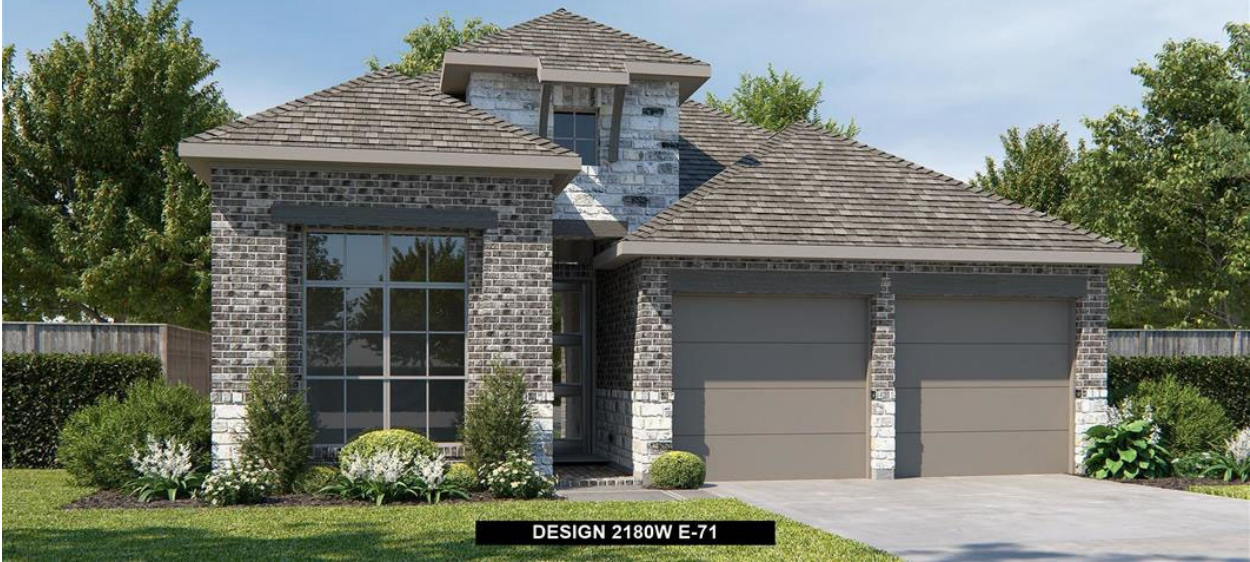
DESIGN 2180W E-71

Representative Image. Features and specifications may vary by community.