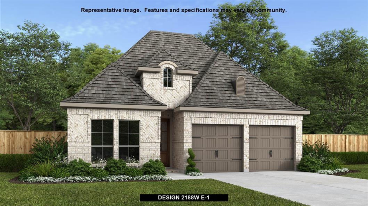
DESIGN 2188W E-1

Representative Image. Features and specifications may vary by community.