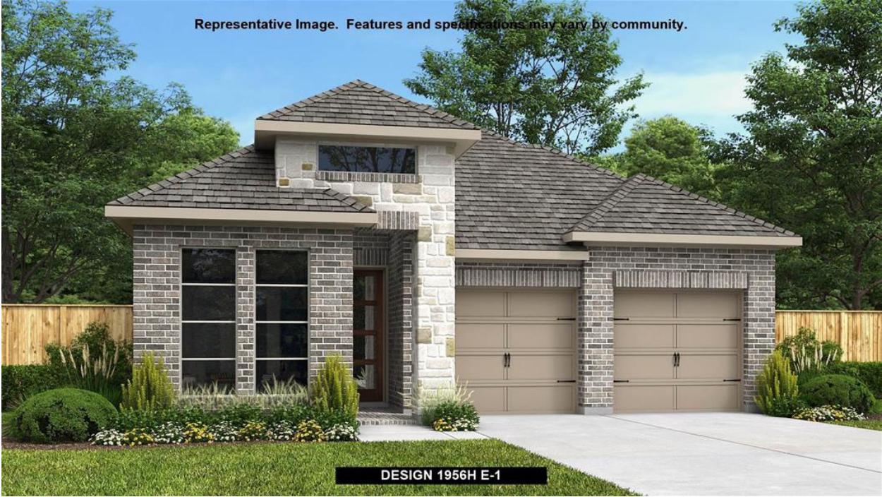
DESIGN 1956H E-1

Representative Image. Features and specifications may vary by community.