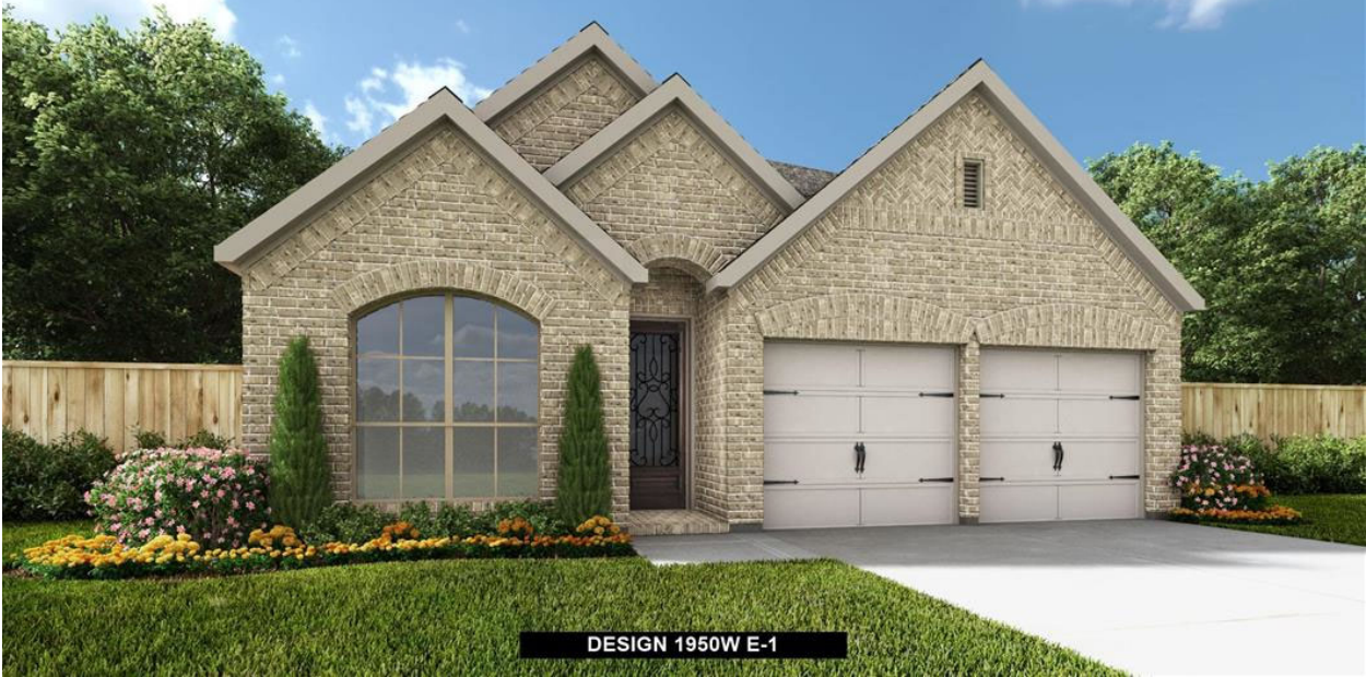
DESIGN 1950W E-1

Representative Image. Features and specifications may vary by community.