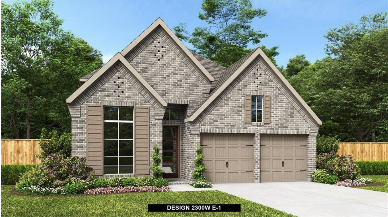
DESIGN 2300W E-1