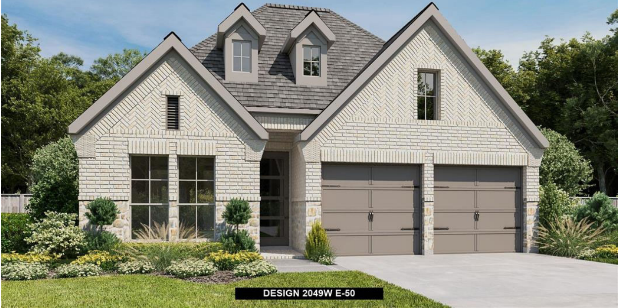
DESIGN 2049W E-50

Representative Image. Features and specifications may vary by community.