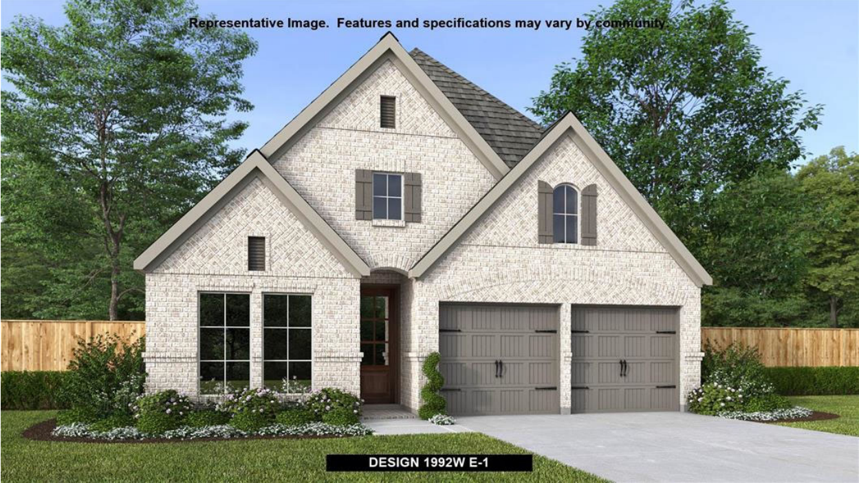
DESIGN 1992W E-1

Representative Image. Features and specifications may vary by community.