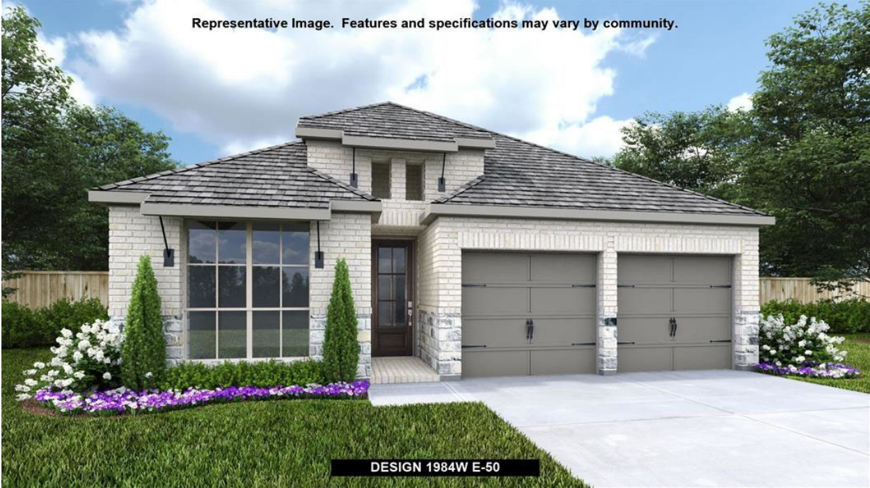
DESIGN 1984W E-50

Representative Image. Features and specifications may vary by community.