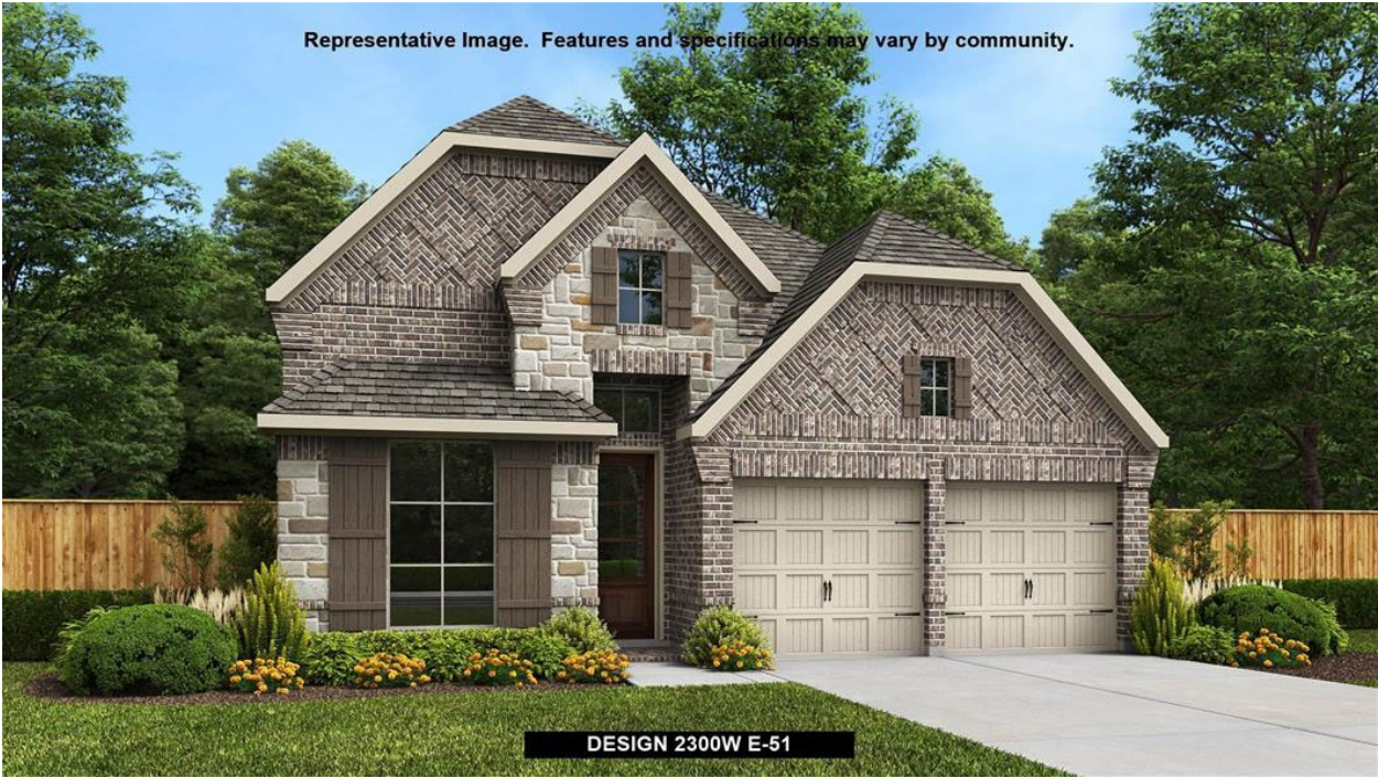
DESIGN 2300W E-51

Representative Image. Features and specifications may vary by community.